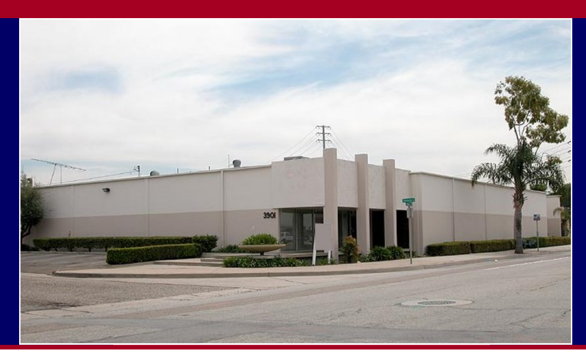
3901 S. MAIN STREET ~ SANTA ANA

11,500 SQ. FT. FREE STANDING INDUSTRIAL BUILDING WITH SHARED FENCED YARD GREAT SOUTH SANTA ANA LOCATION BORDERING IRVINE